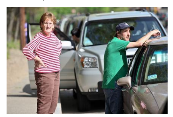
Frustrated residents await a delayed water shipment.