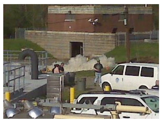
The water main break in Weston, MA that affected two million people.