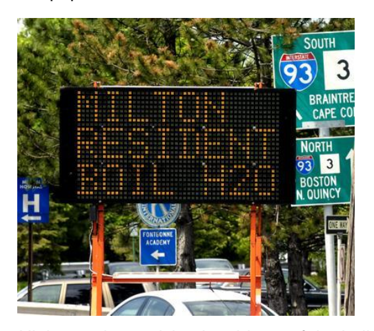
Highway signs advised residents of the boil water order.

Other methods of notifying citizens included social networking sites like Facebook and Twitter (MEMA had gone "live" on those sites just months prior but had not yet actively used them ), traditional media alerts, and flashing highway signs. Some residents and businesses got the news the old-fashioned way from police officers who were dispatched to restaurants and elderly housing areas, and even simply took to roaming the streets with bullhorns. Also mobilized to spread the word were existing local non-profits such as Meals on Wheels that regularly served atrisk populations.