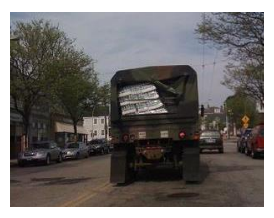
Water being delivered in Watertown, MA by the National Guard

populations in advance. "As more and more care facilities, such as assisted living communities, go private, public officials have less visibility into exactly who is where and what their needs are," he said. He also explained that some channels of communication are "hidden" from officials, so they engaged police community service officers and personnel from the Elderly Affairs Commission to help find as many of those who might need bottled water as possible.