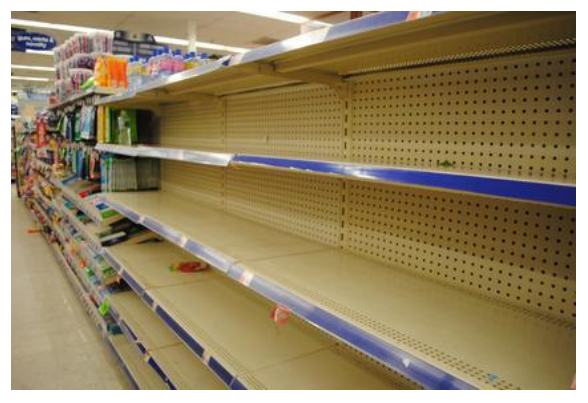
Bottled water was sold out at local stores.

This reaction is an example of the concept of "emotional immunity": many people in the Boston area are resilient in the face of events frequently experienced, such as blizzards, yet that same immunity did not exist for the unexpected water main break even though it was a lesser threat for most people. Such novel events are more likely to cause a descent into the "emotional basement" due to a lack of emotional immunity.